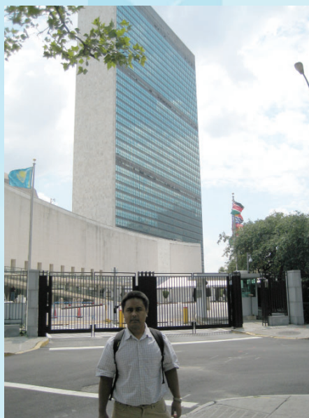
MSS Member at the United Nation H.Q., New York as part of the UNESCO youth Programme, 2008

The school will give equal importance to field exposure programmes, seminars and discussions to support their curricular