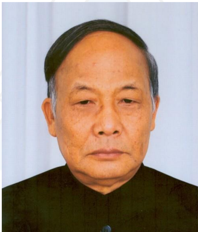
Shri Okram Ibobi Singh (Hon' ble Chief Minister of Manipur)